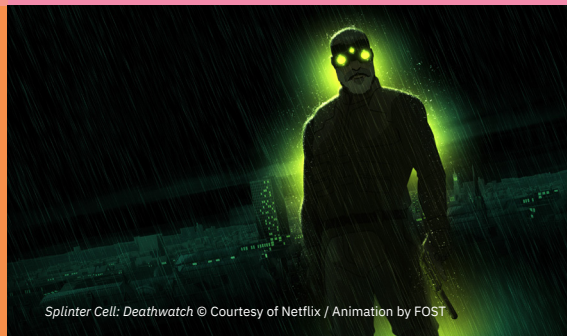
Splinter Cell: Deathwatch © Courtesy of Netflix / Animation by FOST

International hits made in France across all media