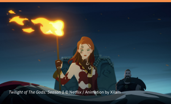
Twilight of The Gods: Season 1 © Netflix / Animation by Xilam