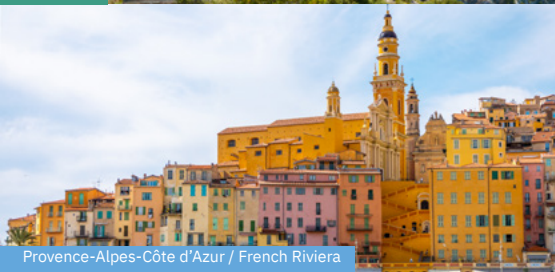
Provence-Alpes-Côte d'Azur / French Riviera