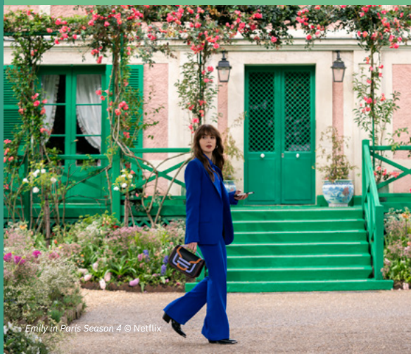
Emily in Paris Season 4