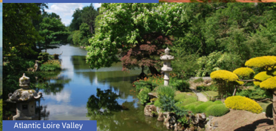
Atlantic Loire Valley