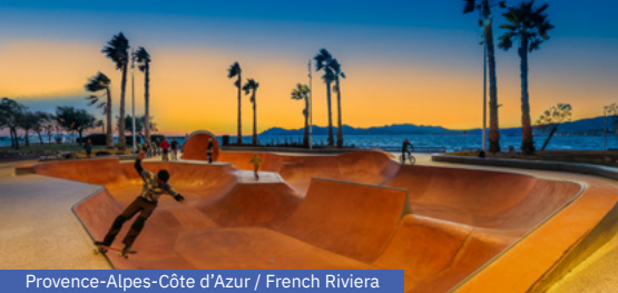
Provence-Alpes-Côte d'Azur / French Riviera