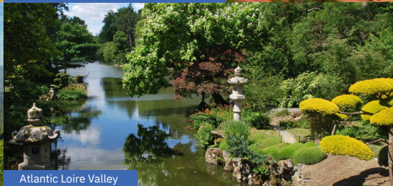
Atlantic Loire Valley