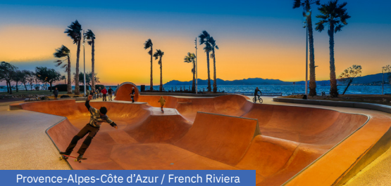
Provence-Alpes-Côte d'Azur / French Riviera