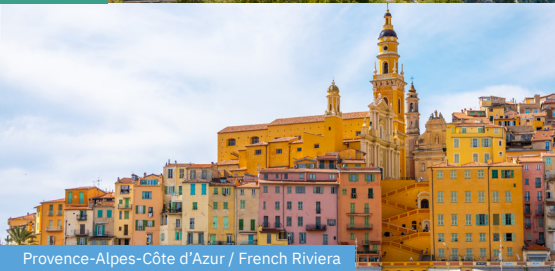
Provence-Alpes-Côte d'Azur / French Riviera