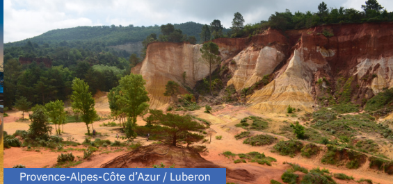
Provence-Alpes-Côte d'Azur / Luberon