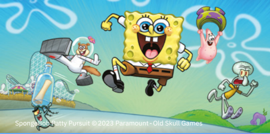
SpongeBob SquarePants Pursuit © 2023 Paramount - Old Skull Games