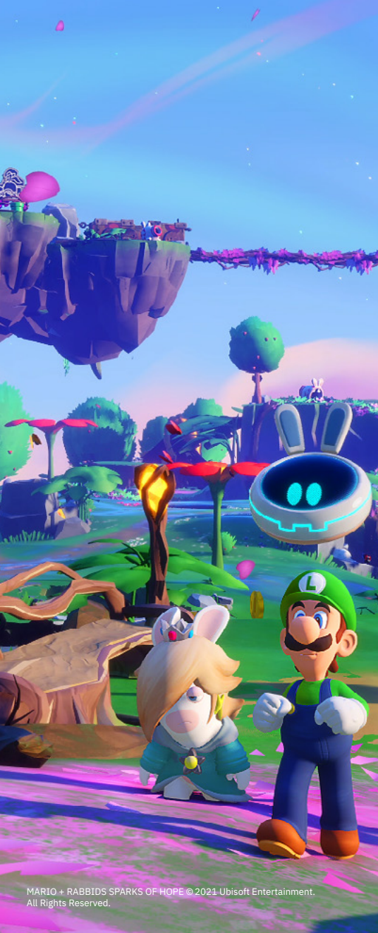
MARIO + RABBIDS SPARKS OF HOPE © 2021 Ubisoft Entertainment. All Rights Reserved.