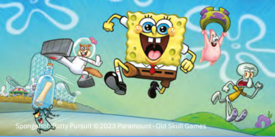
SpongeBob: Fatty Pursuit © 2023 Paramount - Old Skull Games