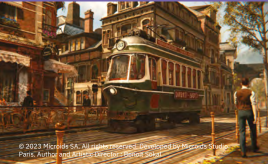
© 2023 Microids SA. All rights reserved. Developed by Microids Studio Paris. Author and Artistic Director: Benoît Sokal