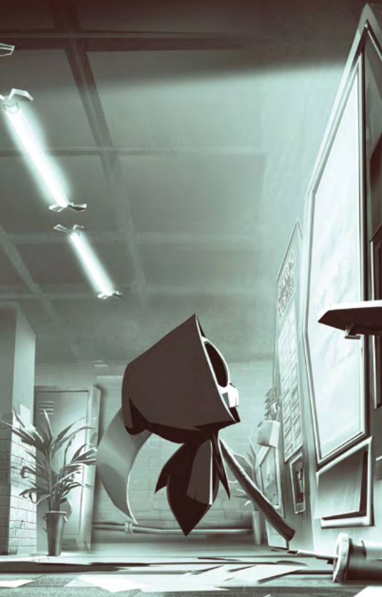
Have a Nice Death © by Magic Design Studios / Gearbox Publishing